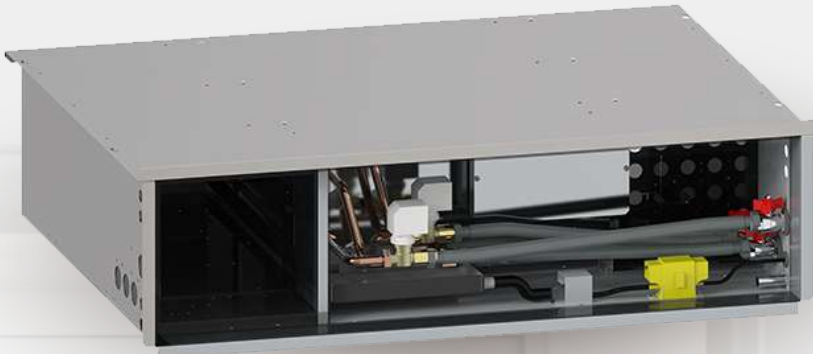
Valve assembly with connectors on the side S - Version.