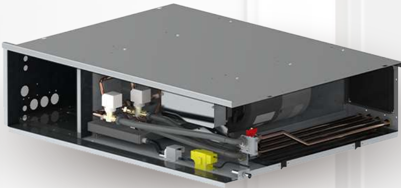
Valve assembly with connectors at the back B - Version.

Installation of the complete box and the machine inside it in the open false ceiling.